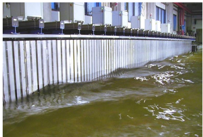
Figure 2: 3D wavemaker equipped with DHI AWACS Active Wave Absorption Control System.

Wind loading on vessels or structures can be simulated by computer-controlled wind fans.