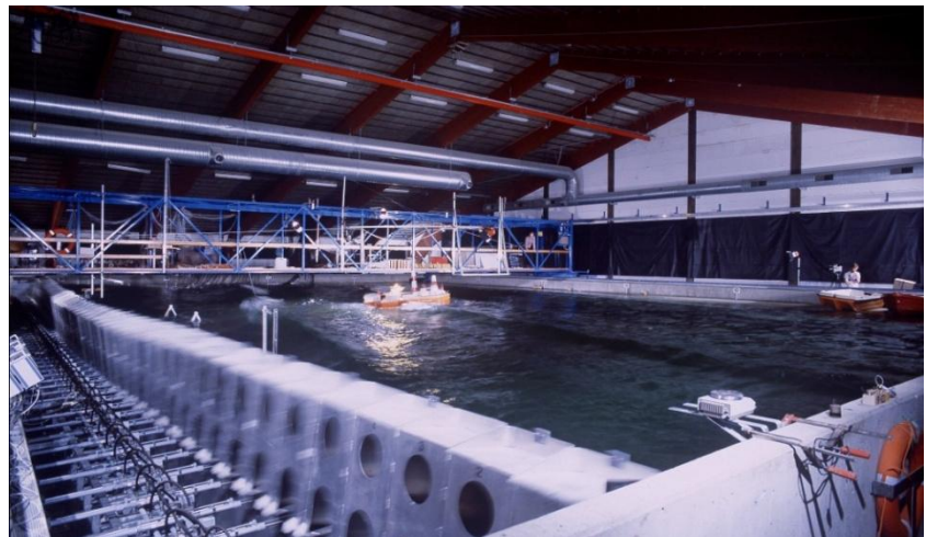
Figure 2: Testing an FPSO in DHI's Offshore Wave Basin

Wind load on vessels or structures can be simulated by computer-controlled wind fans.