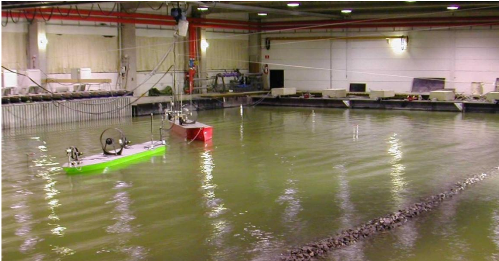
Figure 1: Testing of floating systems in DHI's Shallow Water Basin

DHI's Shallow Water Basin for combined waves and current is 35m long and 25m wide with an overall depth of 0.8m. The basin is ideal for model testing when the effects of combined waves and current are of major importance, for instance scour around structures, and loads on fixed or floating coastal and offshore structures.